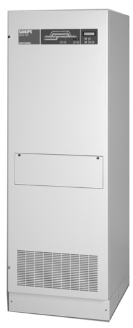
Fig. 1 "SANUPS"A23C 100kVA

On the other hand, with the demand for saving resources and energy conservation, not only reducing the price of the UPS itself but also reducing the running cost is requested.